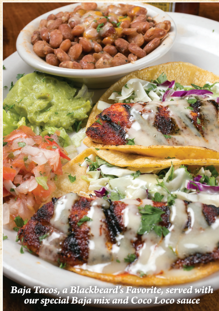
Baja Tacos, a Blackbeard's Favorite, served with our special Baja mix and Coco Loco sauce

BLACKBEARD'S BAJA TACOS Grilled, blackened or fried shrimp or fish on corn-flour tortillas, topped with Baja mix & Coco Loco sauce ..... 8.99