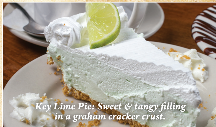
Key Lime Pie: Sweet & tangy filling in a graham cracker crust.