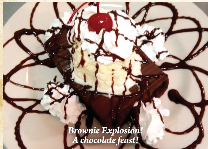
Brownie Explosion! A chocolate feast!