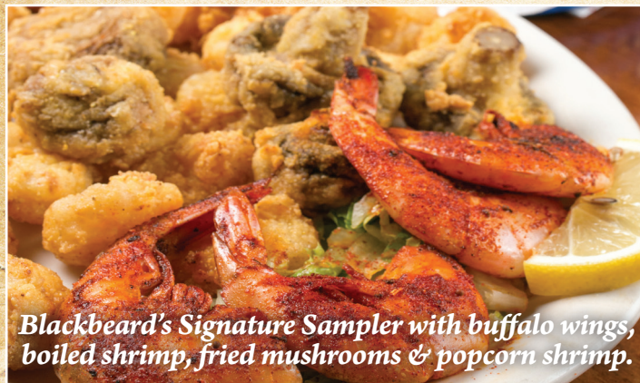
Blackbeard's Signature Sampler with buffalo wings, boiled shrimp, fried mushrooms & popcorn shrimp.